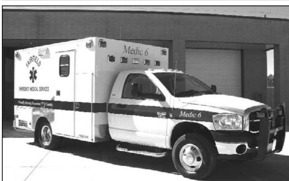
FAIRFIELD AMBULANCE SERVICE recently took delivery on this new ambulance, priced at $118,888. The service, in operation for more than 30 years, mans three ambulances ready to roll 24 hours a day.