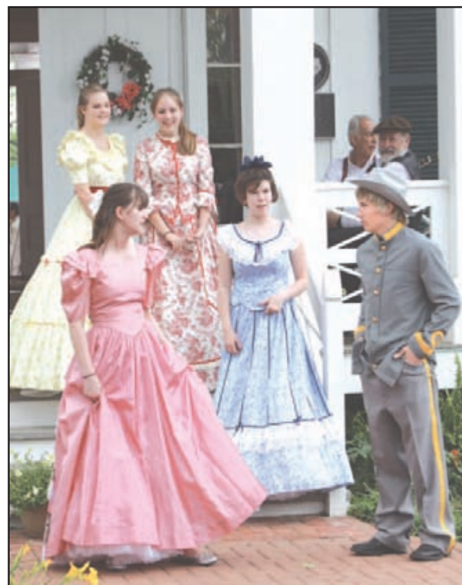
PERFORMING THE HISTORICAL melodrama on Saturday were students from Fairfield high school. The play gives a fictionalized account of Freestone county starting just prior to the Civil War with Col. Moody's arrival in Fairfield.

Vendors and a demonstration blacksmith set up