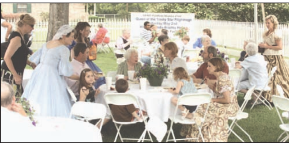
VISITORS DINED ON THE lawn of Fairfield's historic Moody-Bradley House during the History Club's annual pilgrimage.